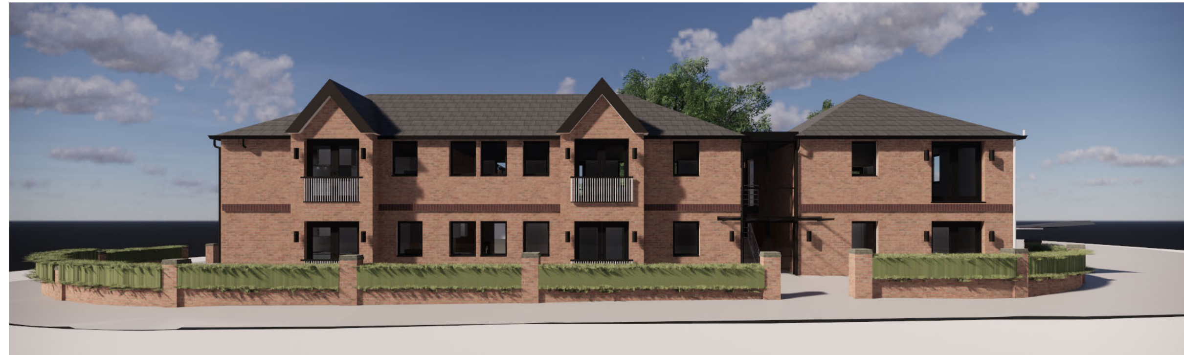
3 3D View 3 - PRIVATE ROAD - STREET SCENE 1 : 1

The copyright of this drawing is vested with Corstorphine + Wright Ltd and must not be copied or reproduced without the consent of the company.