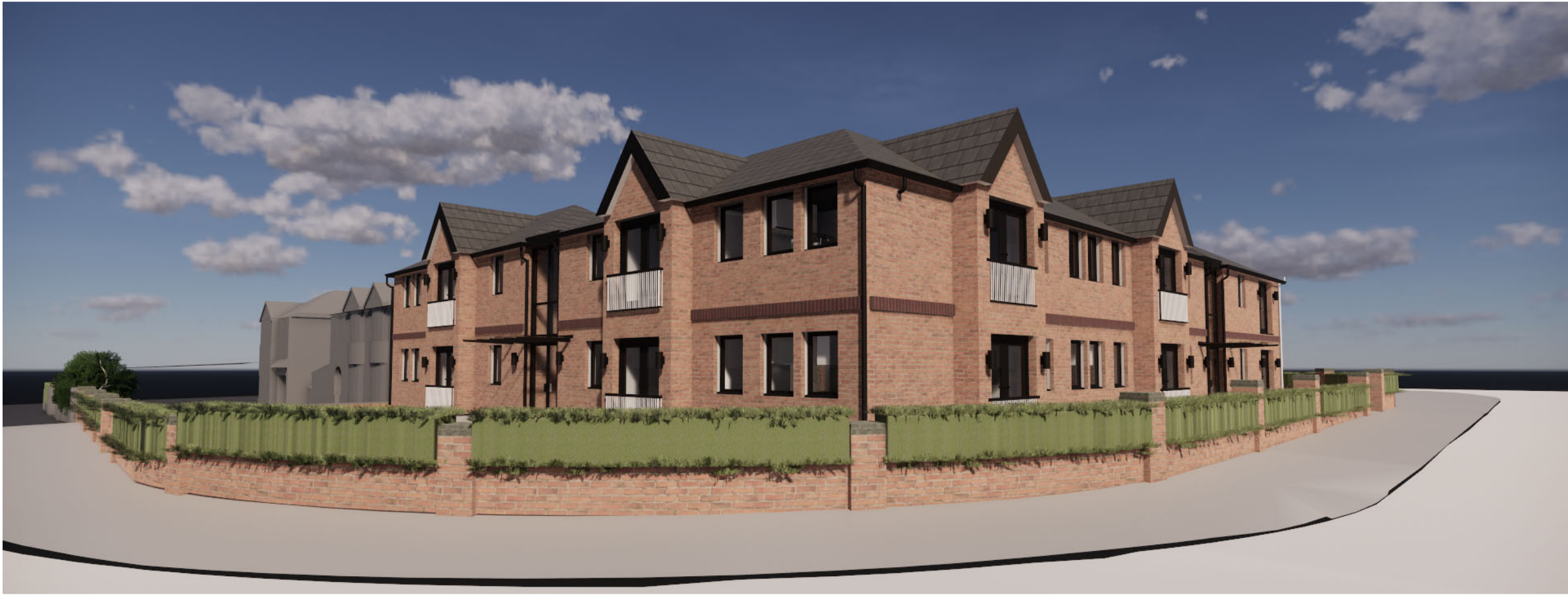
1 3D View 1 - MANCHESTER ROAD (A635) - CORNER PERSPECTIVE 1 : 1