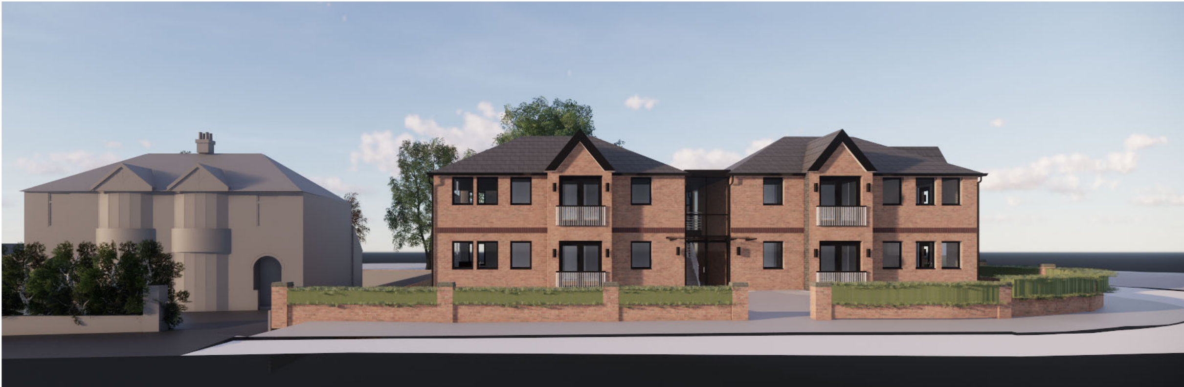
2 3D View 2 - MANCHESTER ROAD (A635) - STREET SCENE 1 : 1